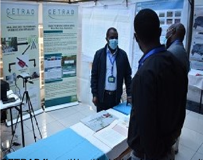
GETRAD is participating in the symposium and will be demonstrating the removals via